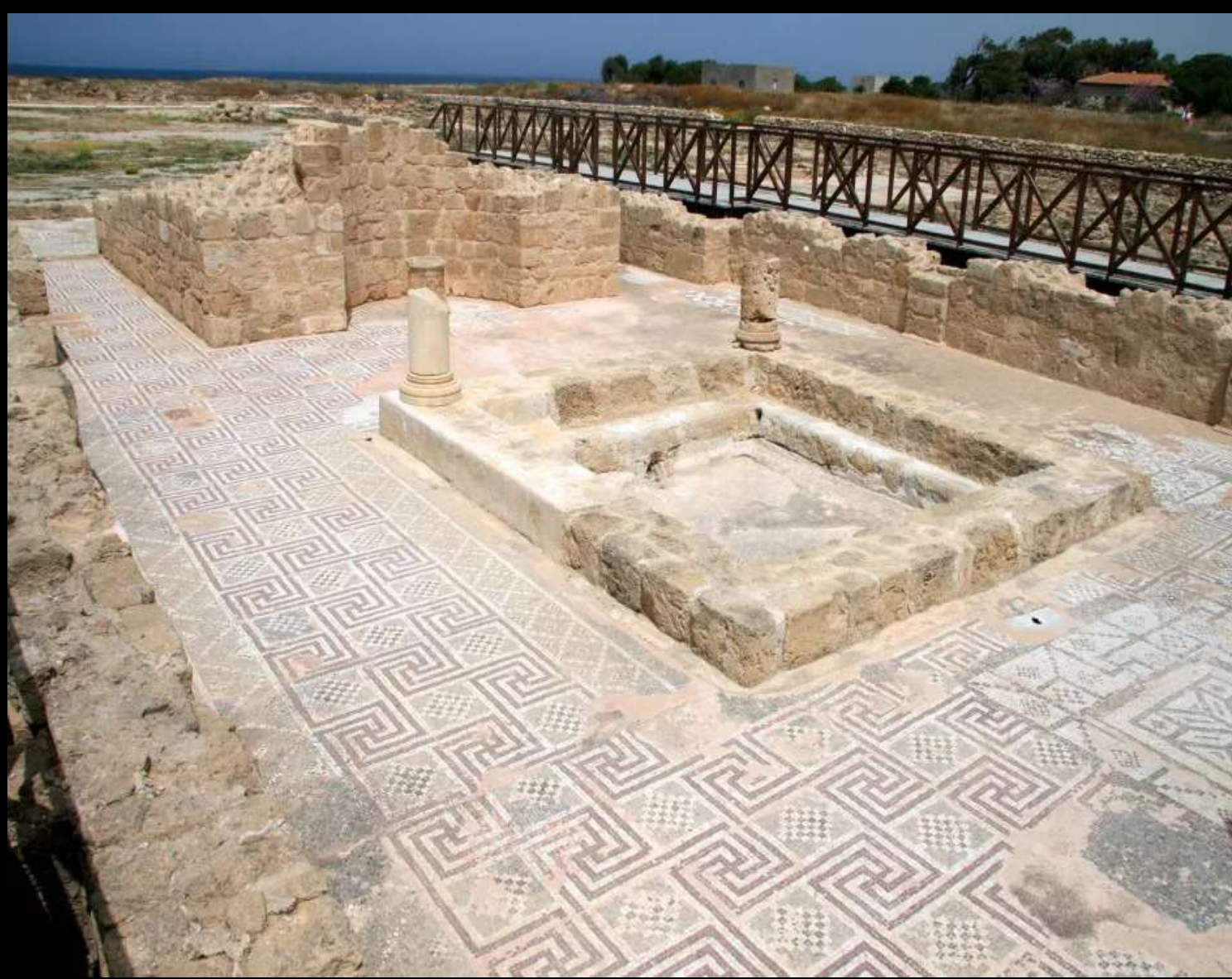
Atrium of the “House of T Proconsul's Villa